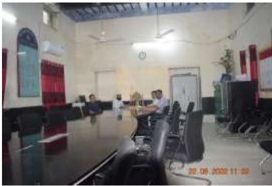
Teachers' Common Room