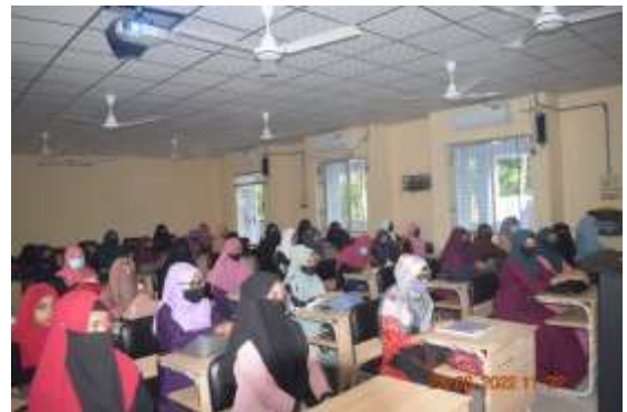
Special Class Room