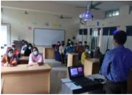
In-house Training (3 rd & 4 th class employee