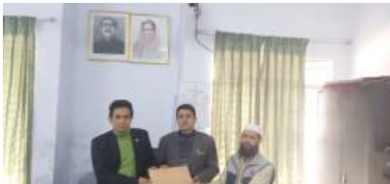
Delivered the Internal Audit report to the Principal by the Audit Committee.

Chandpur Govt Mohila College performed in the internal audit in every year.