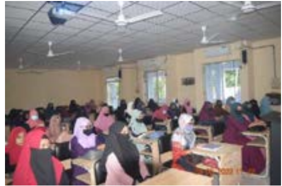
Special Class Room