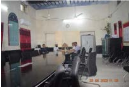
Teachers' Common Room